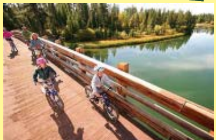
35 miles of biking paths