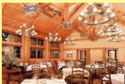
Multiple dining options