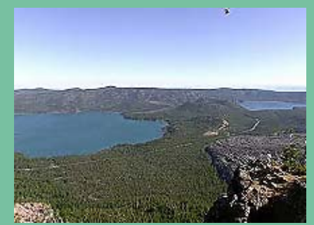
Newberry Nat'l Volcanic Monument Cascade Lakes Scenic Byway