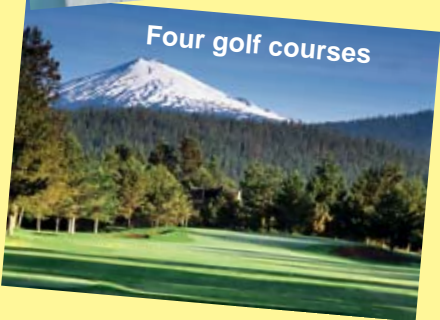
Four golf courses