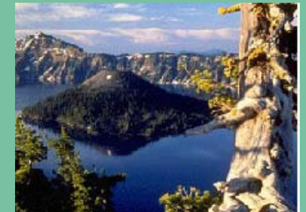
Crater Lake National Park Smith Rock State Park