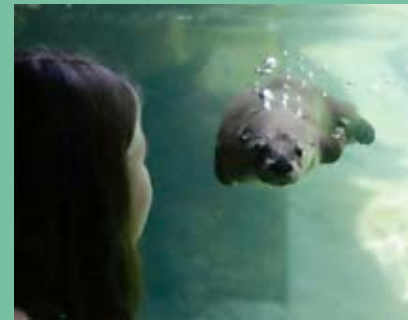
High Desert Museum Lava Lands Visitor Center