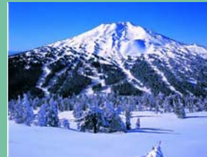
Mt. Bachelor Paulina Peak