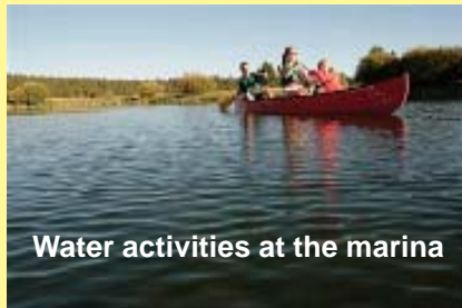
Water activities at the marina